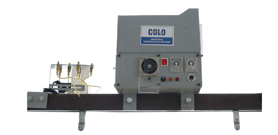
Auto Lubricator for conveyor chain system