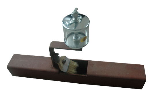
Manual oil cup